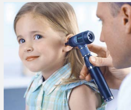
ENHANCES VISUALIZATION OF THE EARS

In addition to the features of the MacroView Otoscope, the Digital MacroView Otoscope allows you to share images with family members or other physicians, and save still images to your patient's electronic chart or health record to track progression.