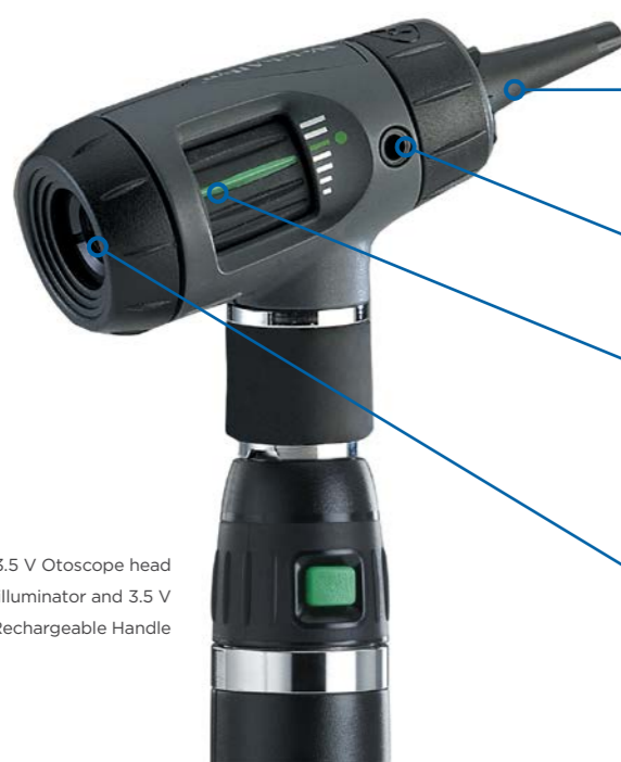
MacroView 3.5 V Otoscope head with throat illuminator and 3.5 V Lithium Ion Rechargeable Handle

Proprietary "Tip Grip" helps ensure specula are secured and ejects used ear speculum for easy disposal